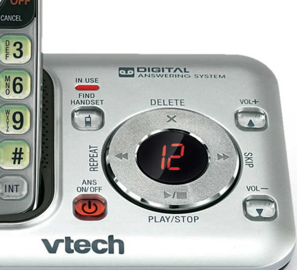
Protect yourself from identity theft with digital security—your call is digitized and encrypted, making it nearly impossible for someone to eavesdrop